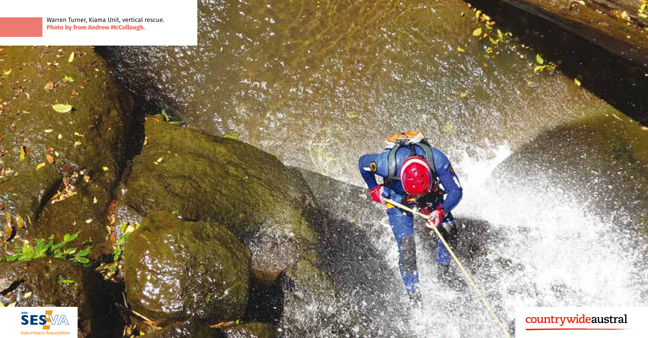
Warren Turner, Kiama Unit, vertical rescue.