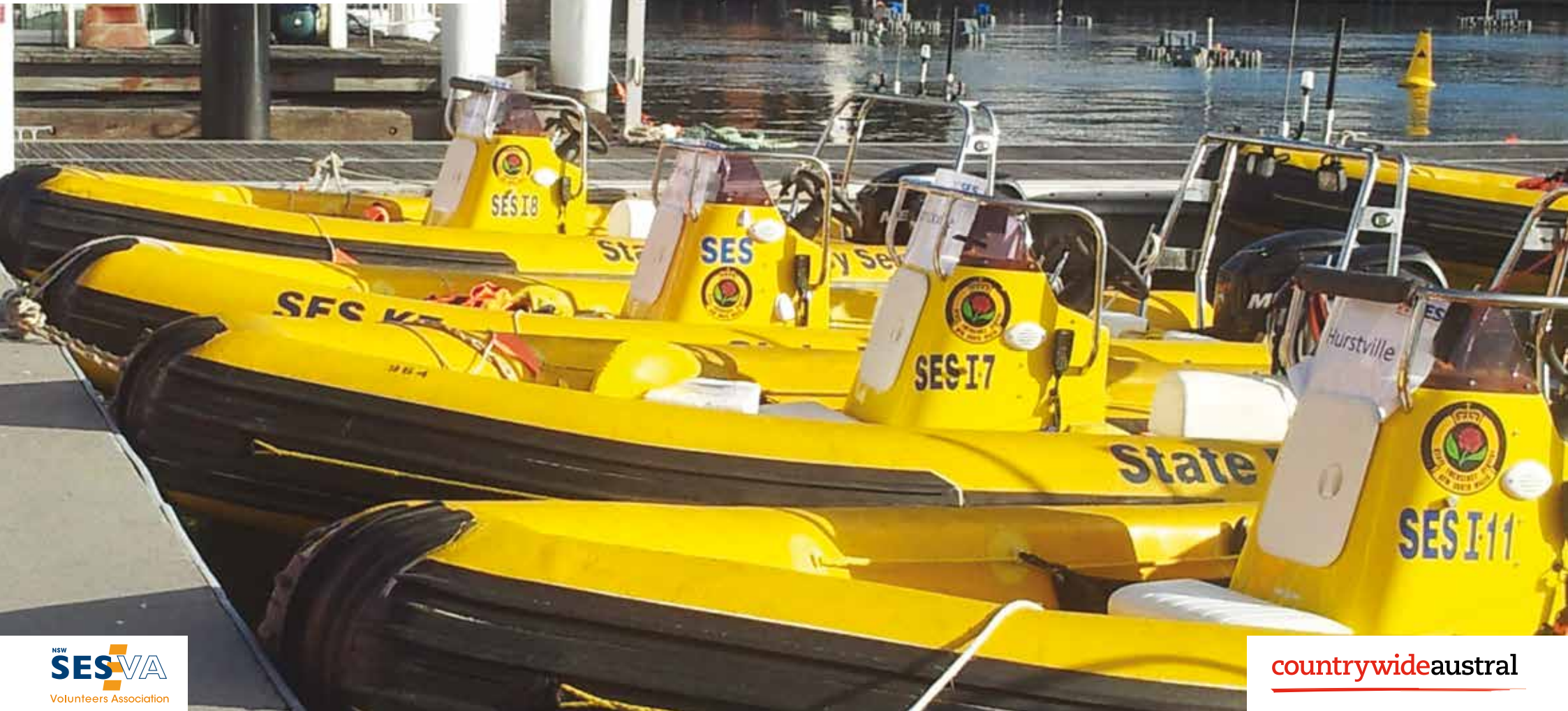
Flood Boats on Darling Harbour.